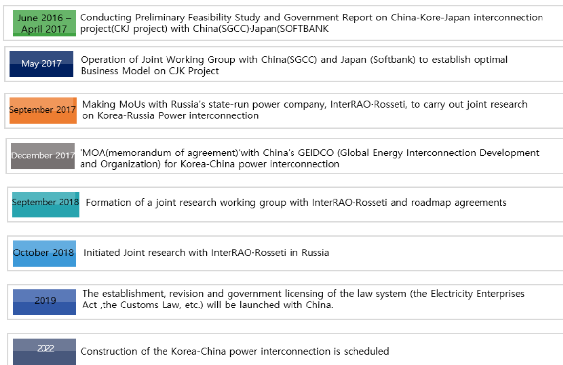
Figure 2: The Role of KEPCO in a Recent Power Interconnection Project in Northeast Asia