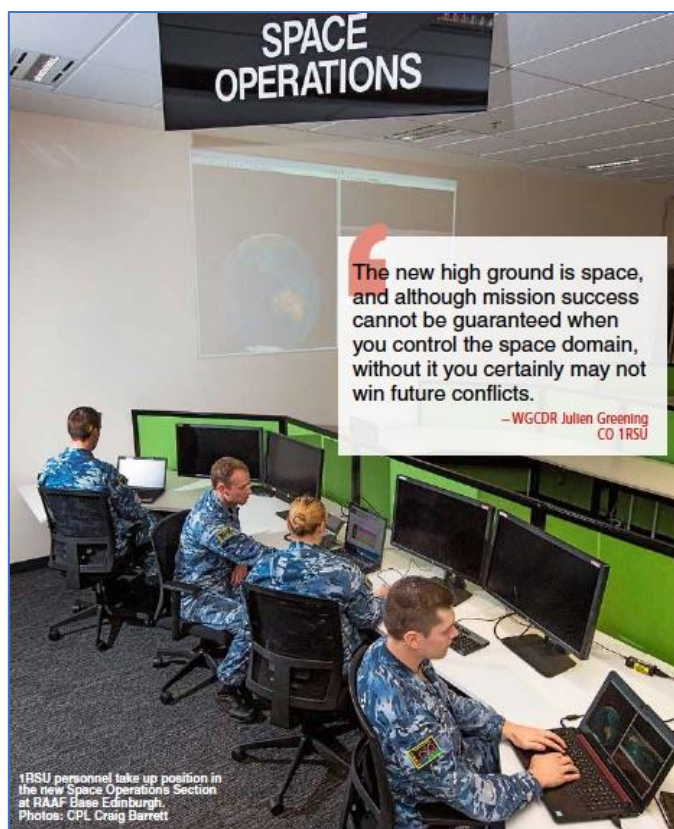
Figure 6. Space Operations Section, 1 Remote Surveillance Unit, RAAF Edinburgh