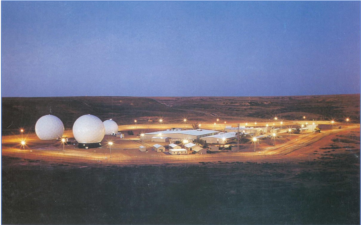
Figure 1. Joint Defence Facility – Nurrungar by night, 1999