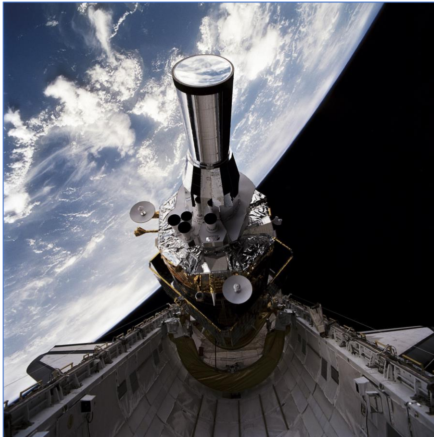
Figure 4. Defense Satellite Program Flight 16 (DSP-16) deploying from Space Shuttle mission Atlantis STS-44, launched 24 November 1991

Note: DSP components include Infrared (IR) sensor (top), ARI (Advanced RADEC [Radiation Detector] I), SHF Antenna, EHF Antenna, Link 2 High-Gain Antenna, star sensor, and stowed solar paddles (box-like structure around the base).