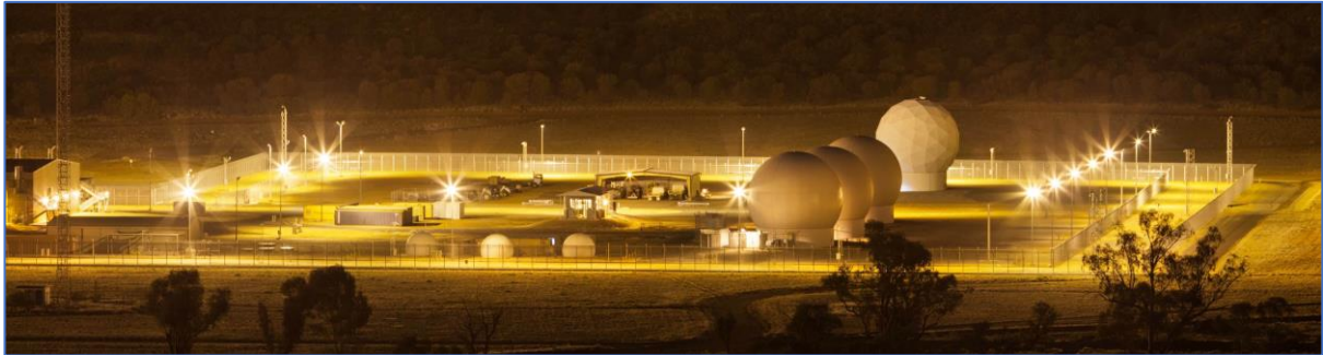
Figure 2. The Relay Ground Station compound, Pine Gap (December 2014) (from left to right, Antennas 05-B, 12-A, 05-A, 13-A, 98-A, 98-B and 13-B)