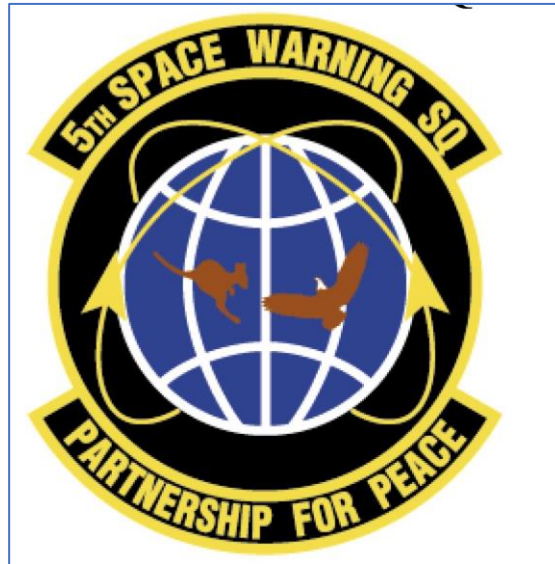
Figure 5. USAF 5 th Space Warning Squadron badge