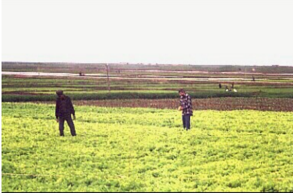
Laying out the tower rigging.