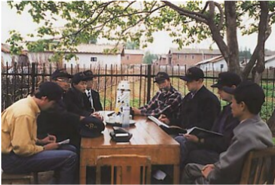
In Onch'on, DPRK: Planning briefing for the DPRK wind energy project.