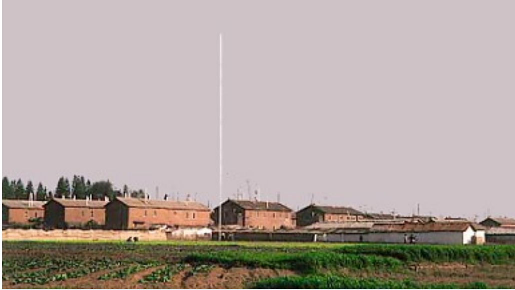
The tower with the village behind it.