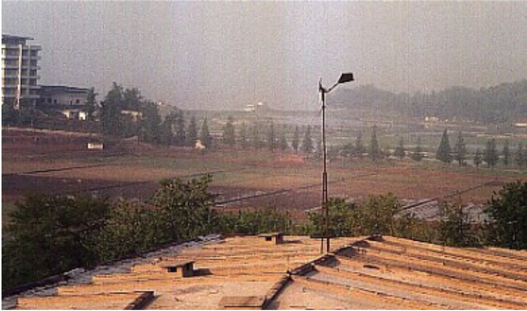
Small DPRK-made wind turbine atop restaurant in Nampo, DRPK