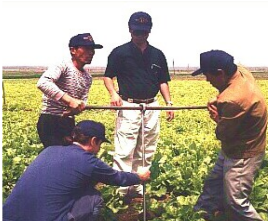
Drilling the tower anchor into the field