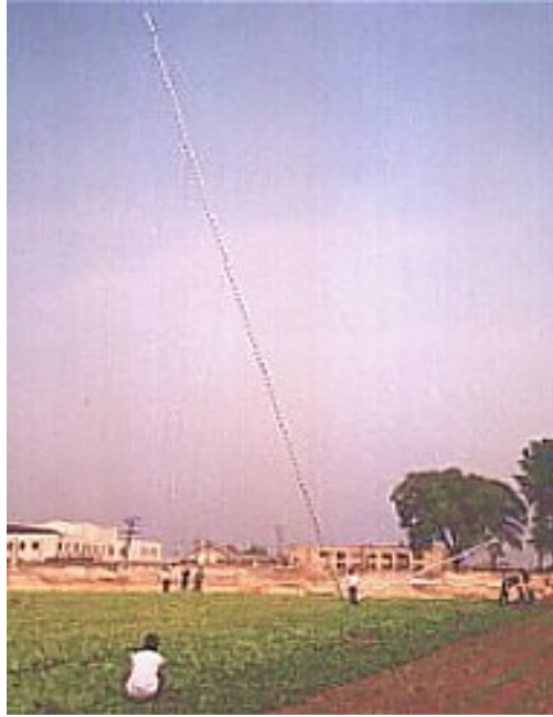
Raising the tower... carefully, slowly, safely.