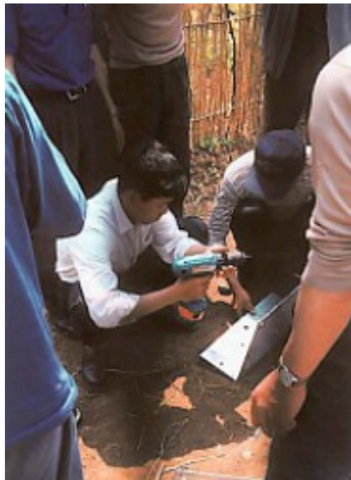
Using new tools to bolt together the tower base.