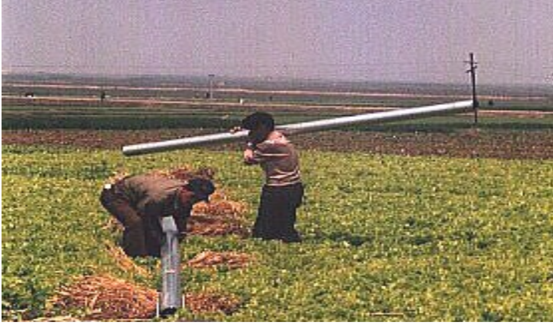
Laying out the tower pipe in the vegetable field.