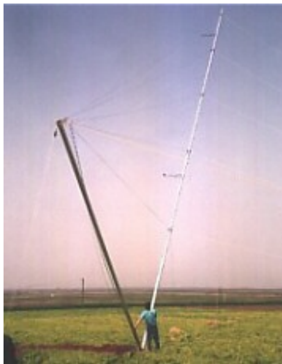
Raising the 100-foot tower with two anemometers... gently does it!