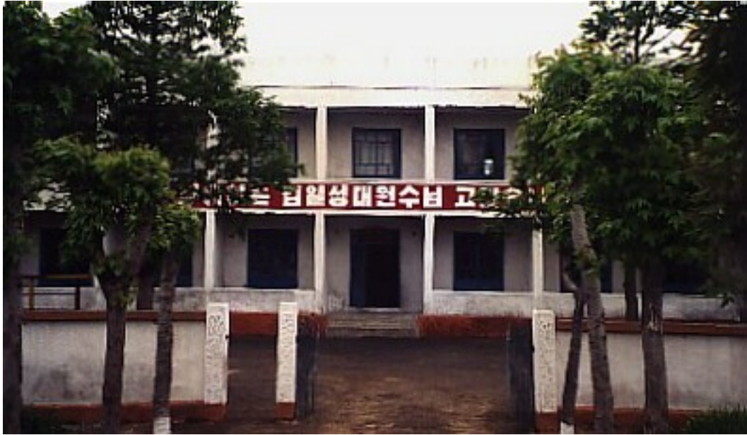
Kindergarten to be electrified in the village.