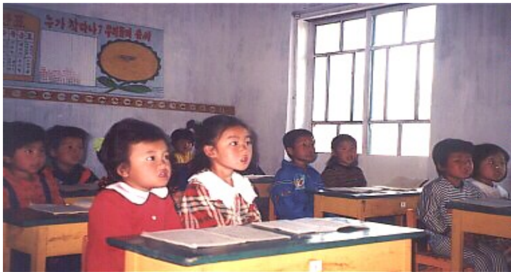
Kindergarten to be electrified