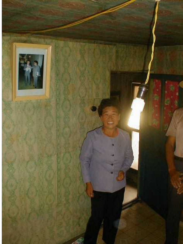
Figure 5: "Trust but Verify—Installing New CFL Bulbs, 9/2002