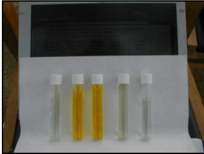
Figure 3: Water Samples Tested for Coliform (fecal origin) Bacteria: Four Samples at Left are From Unhari Water Supplies (yellow color indicates contamination)

Other anecdotes include working on top of a 40 foot tower in a considerable breeze with a Korean engineer, trusting that he will be as careful as you will (Figure 4), and looking out every day at the cabbage patch that hosts the windmill towers, and counting, in Korean, with the Farm Manager and other villagers as the windmills, one by one, were hauled up onto their towers and switched on.