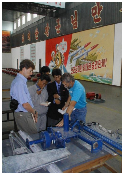
Nautilus team in Electric Appliance Factory #1 in Pyongyang inspecting wind turbines in 1998. On the wall behind, the big horizontal banner says, "Long Live the great general" (that is, Kim Jong-il). The poster with missiles below that banner says, "Long Live the Great Victory of Seongun Jeongchi" (that is, Military First Politics)

North Korea does not publish a military white paper or any other statistics related to its military forces for that matter. That's left to the US Defense Intelligence Agency, or the ROK National Intelligence Agency. It does, however, constantly pump out propaganda about its "physical deterrent" capabilities, and often refers in general ways to its ability to crush US and ROK forces, melding images of individual soldiers hurling themselves onto American tanks clutching a hand grenade with graphic images of missiles attacking the DPRK's enemies. These do not just appear on stamps or North Korean websites. They are found everywhere in "daily life," on billboards, in factories, in schools. We encountered one in an electric appliance factory in Pyongyang while discussing North Korea's wind turbines in 1998. However, these ubiquitous images are almost always condensed symbols with little "hard" information.