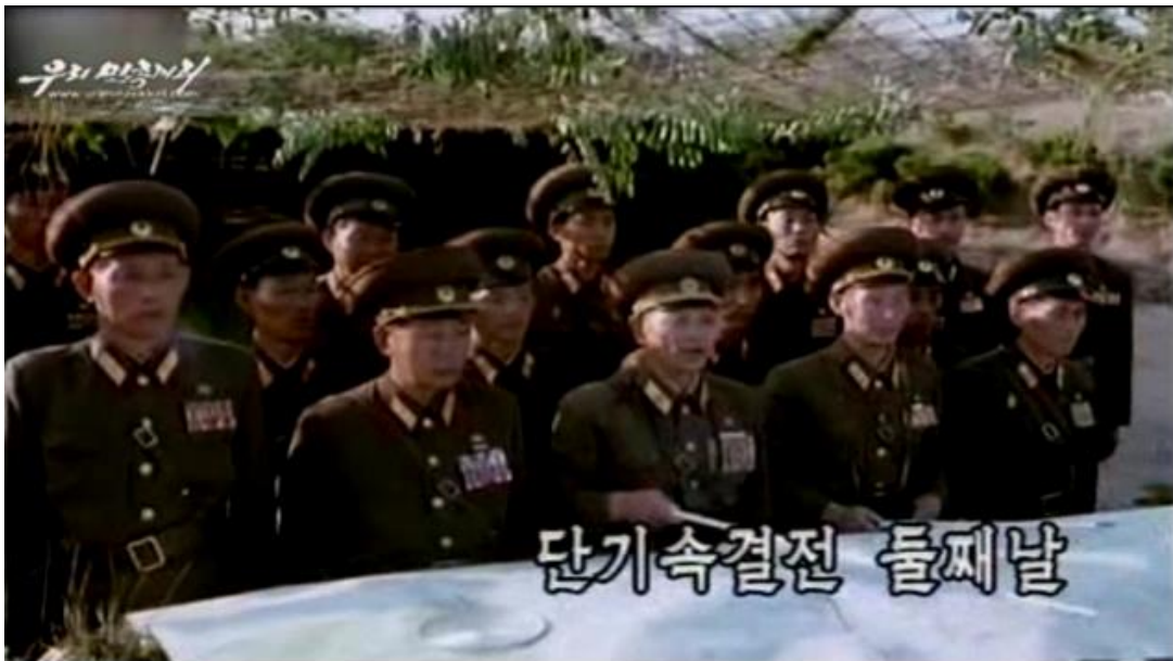
Narrator: "The second day of the short-term, quick war is a day when the people's army beings an all-out offensive heading south," (directed, apparently, by these ancient generals)

Their problem is that last time they played that hand, they were stalemated at the DMZ after three years of bloody war in which millions of Koreans and Chinese died, and scores of thousands of soldiers from other countries. This time, it would take months, not years, for the US and the ROK to repel and then destroy the North Korean military, and there is little prospect of restoration of the DMZ once a war breaks out. The U.S. and China share broad economic and security objectives this time instead of the antagonistic world-views of the 1950s. North Korea faces defeat, not stalemate, in short order.