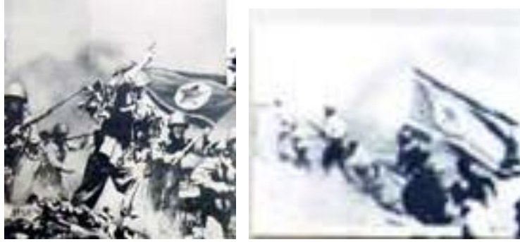
North Koreans in battle in Korean War. The actions in the two preceding pictures are separated by 60 years, but conceptually they remain frozen in time.