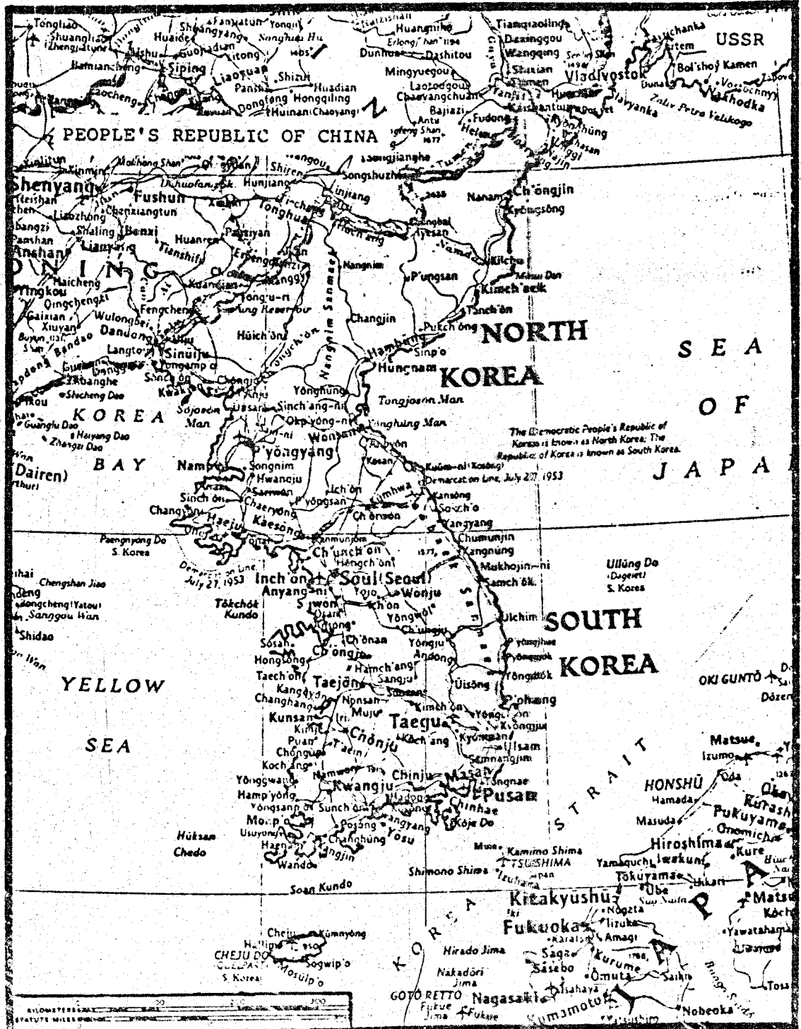
Figure 1 THE KOREAN PENINSULA

Adapted from National Geographic Map of PRC, dtd Jul 1980.