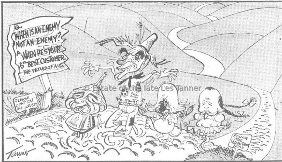
Somewhere over the rainbow