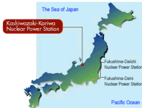
Map showing location of the Kashiwazaki-Kariwa plant

In the past two years, major quakes took place in close proximity of three nuclear power plants: the Onagawa plant in Miyagi Prefecture (August 2005), the Shika plant in Ishikawa Prefecture (March 2007) and the Kashiwazaki-Kariwa plant. In each case, the maximum ground motion caused by the quake was stronger than the seismic design criteria for the nuclear power plants. The latest temblor near Kashiwazaki generated a peak ground acceleration of 993 gal, compared with the design value of 450 gal.