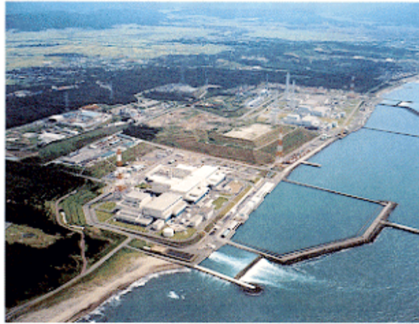
The Kashiwazaki-Kariwa plant

combination of an earthquake and a nuclear meltdown, could have occurred.