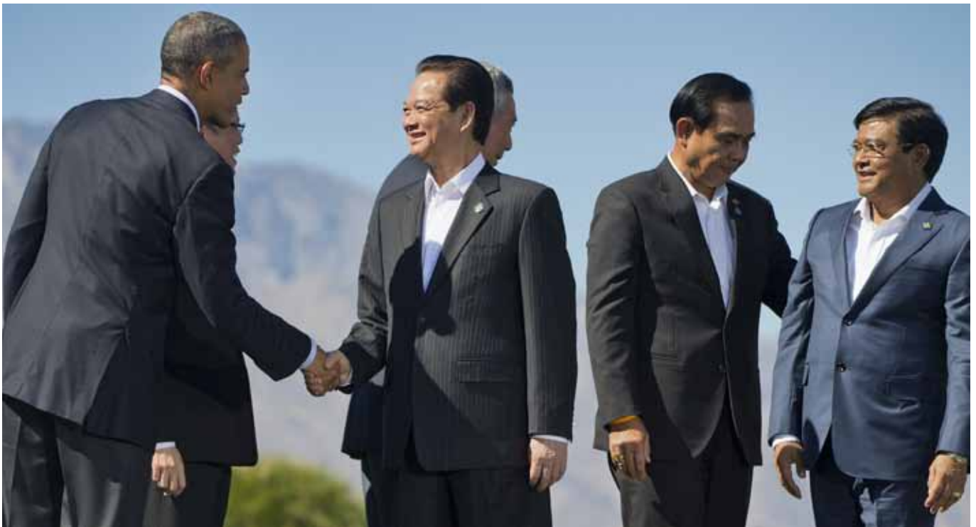
US President Barack Obama greets Vietnamese Prime Minister Nguyen Tan Dung at the meeting with ASEAN leaders at the Annenberg Retreat, Sunnylands, California, in February 2016. ASEAN nations can profit from separate US and Chinese efforts to ‘win friends and influence people’.

With US–China tensions at a medium level, ASEAN countries would profit from the separate efforts of both countries to ‘win friends and influence people’. This is why China bought a possibly overpriced power station from the now-infamous 1Malaysia Development Berhad, why President Obama played golf with Malaysian Prime Minister Najib as a show of political support, why China made a more generous offer than Japan to build the high speed railway connecting Bandung and Jakarta, and why the US granted extraordinary exemptions to Vietnam