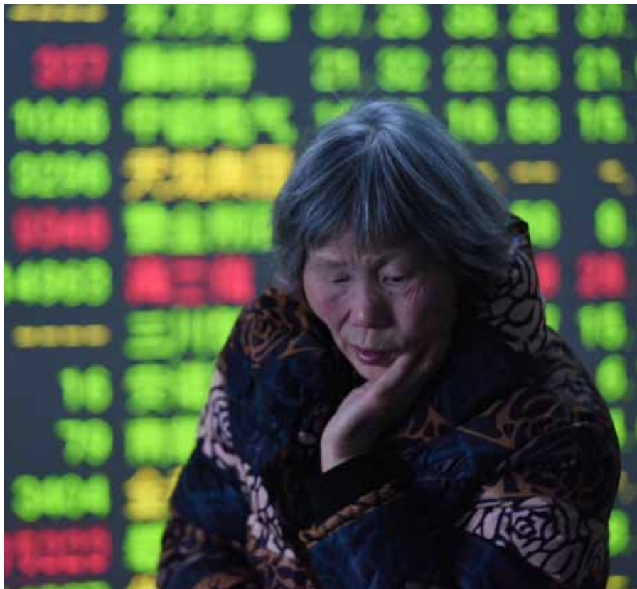
Green signals falling prices and rising concerns for this investor in Hangzhou, China, in February 2016. Despite ups and downs, well-developed financial markets allocate capital efficiently.

global technology frontier, the ability to upgrade, catch up and innovate is important to their closing that distance. To reach the frontier, countries need to be open to ideas and have institutions that allow for more complex interactions across the economy. That would seem to include good governance characterised by decentralised economic decision-making.