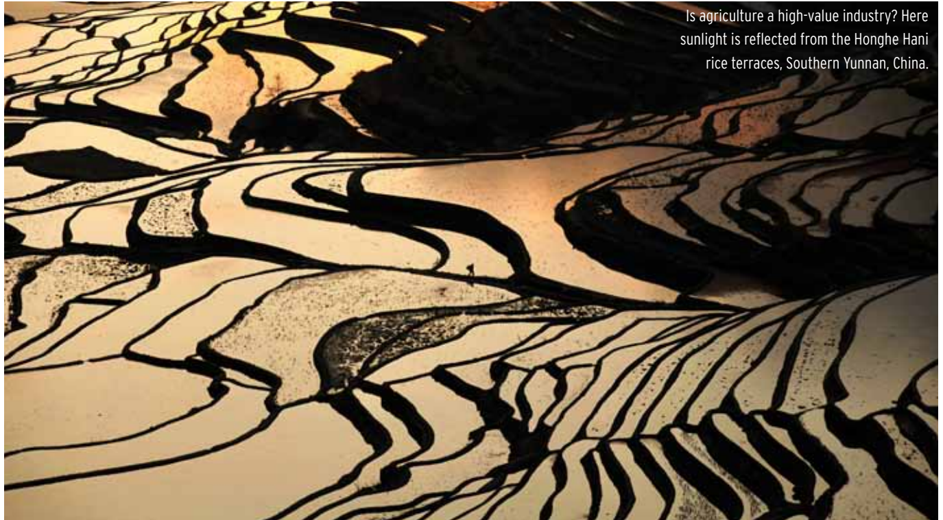
Is agriculture a high-value industry? Here sunlight is reflected from the Honghe Hani rice terraces, Southern Yunnan, China.