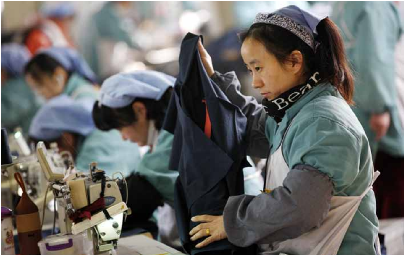
Workers making clothes for export at a factory in Huaibei city, China: countries that have joined global value chains have seen productivity rise.