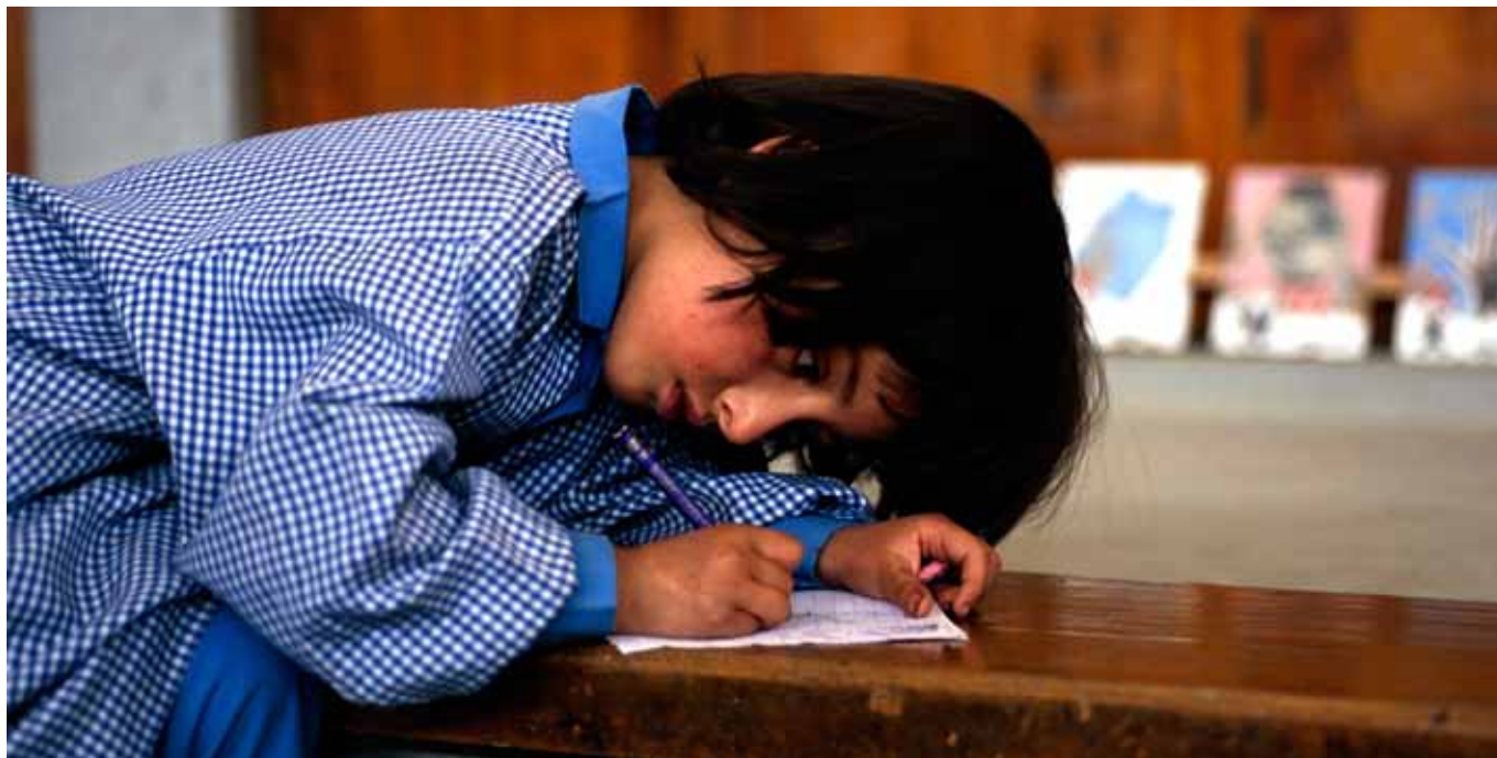
Practising writing at a school in Gilgit, northern Pakistan: experience suggests that education holds the key to nations graduating from middle-income status.

teamwork, problem-solving and communication skills.