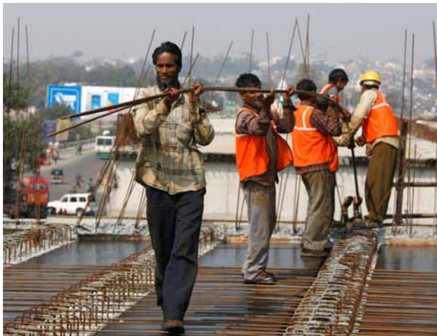
Workers laying reinforcing at an overpass bridge in Jammu in January 2016. Fair land acquisition is a precondition for large-scale investment in growth-supporting public infrastructure in India.

More broadly, the task facing Indian reformers will be made more difficult by three factors that were not faced by other rapid industrialisers in the region. One is the political economy of a large but underdeveloped country. India's democracy is vibrant, but the sheer size of the poor population means that there is a constant temptation for policymakers to focus their attention on spending tax revenues on handouts rather than on stoking economic growth in order