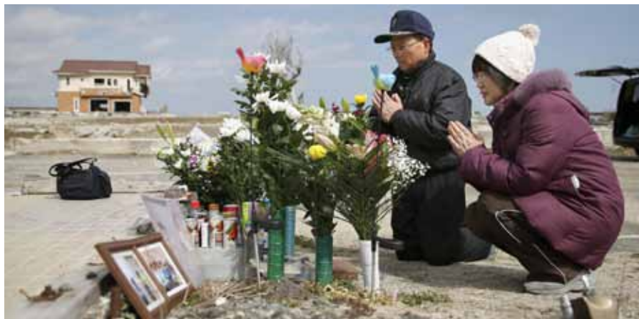
A couple offer prayers for the dead at a commemoration in Namie, Fukushima province.