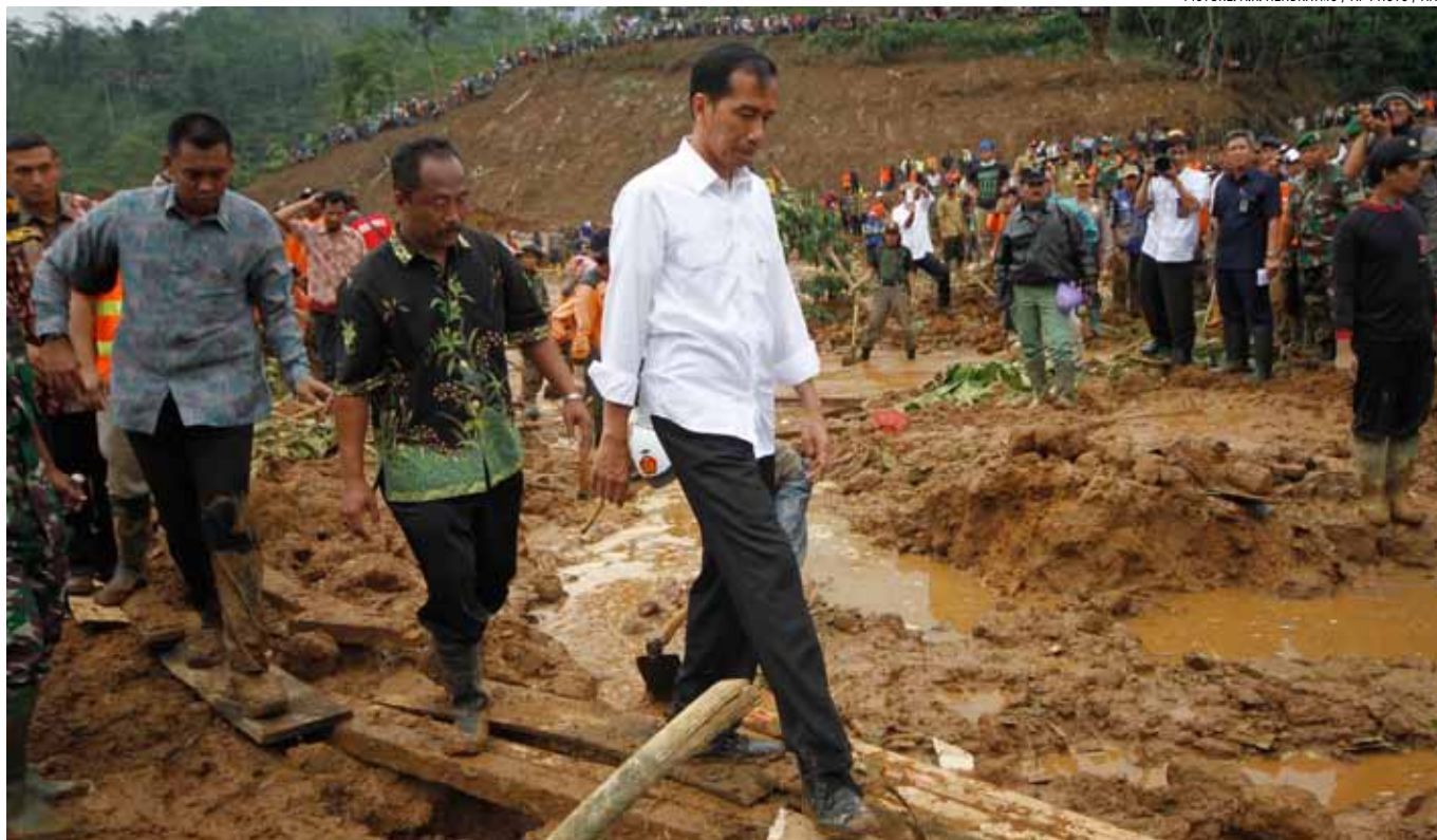
President Joko Widodo inspects the site of a landslide in Jemblung, Java, in December 2014. Underinvestment has contributed to low-quality infrastructure.

During 1966–96, formal sector employment and modern sector wages grew strongly. The Asian financial crisis resulted in a sharp fall in formal employment and real wages. Democratisation unleashed powerful ‘pro-labour’ sentiments. Increased labour market regulation and slower growth resulted in anaemic formal sector employment growth, especially in the manufacturing sector, which had been a key source of dynamic growth. As a result, Indonesia lost competitiveness in international markets for labour-intensive manufactures.