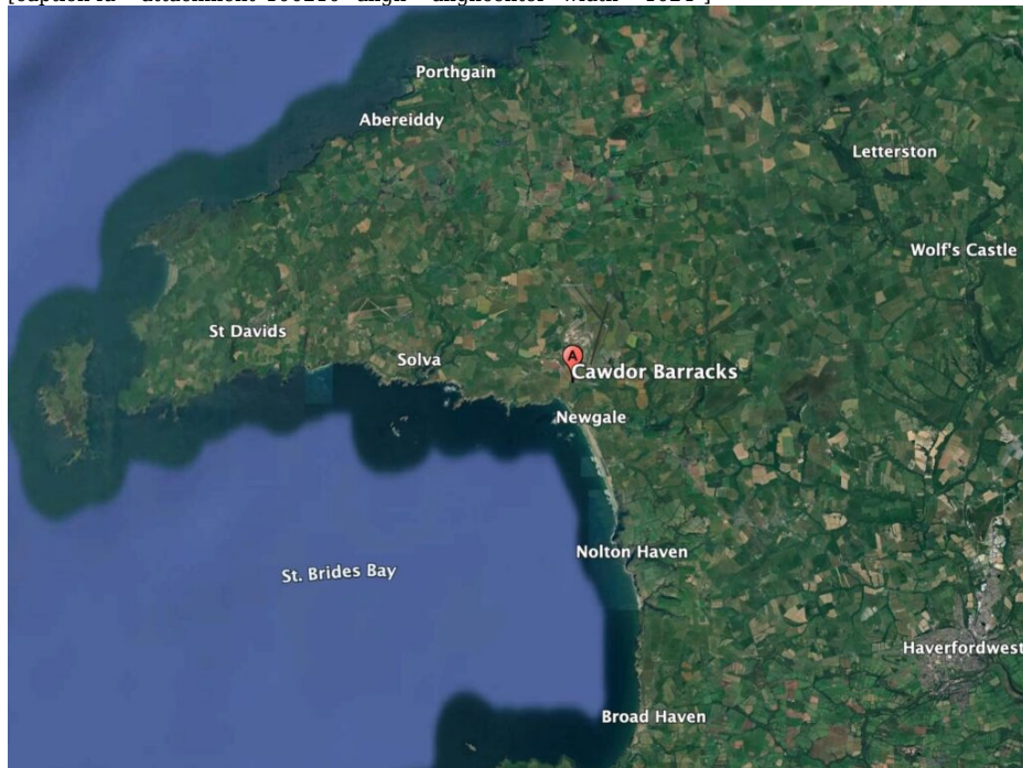
DARC Site 2, Cawdor Barracks, Pembrokeshire, Wales[/caption]

[caption id="attachment_100210" align="aligncenter" width="1024"]