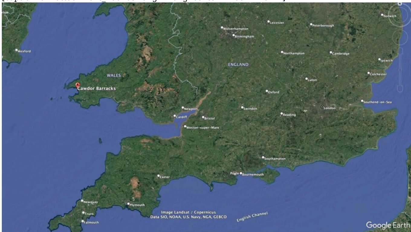
Cawdor Barracks, St Davids, Wales - Google Earth map[/caption]

[caption id="attachment_100209" align="aligncenter" width="1024"]