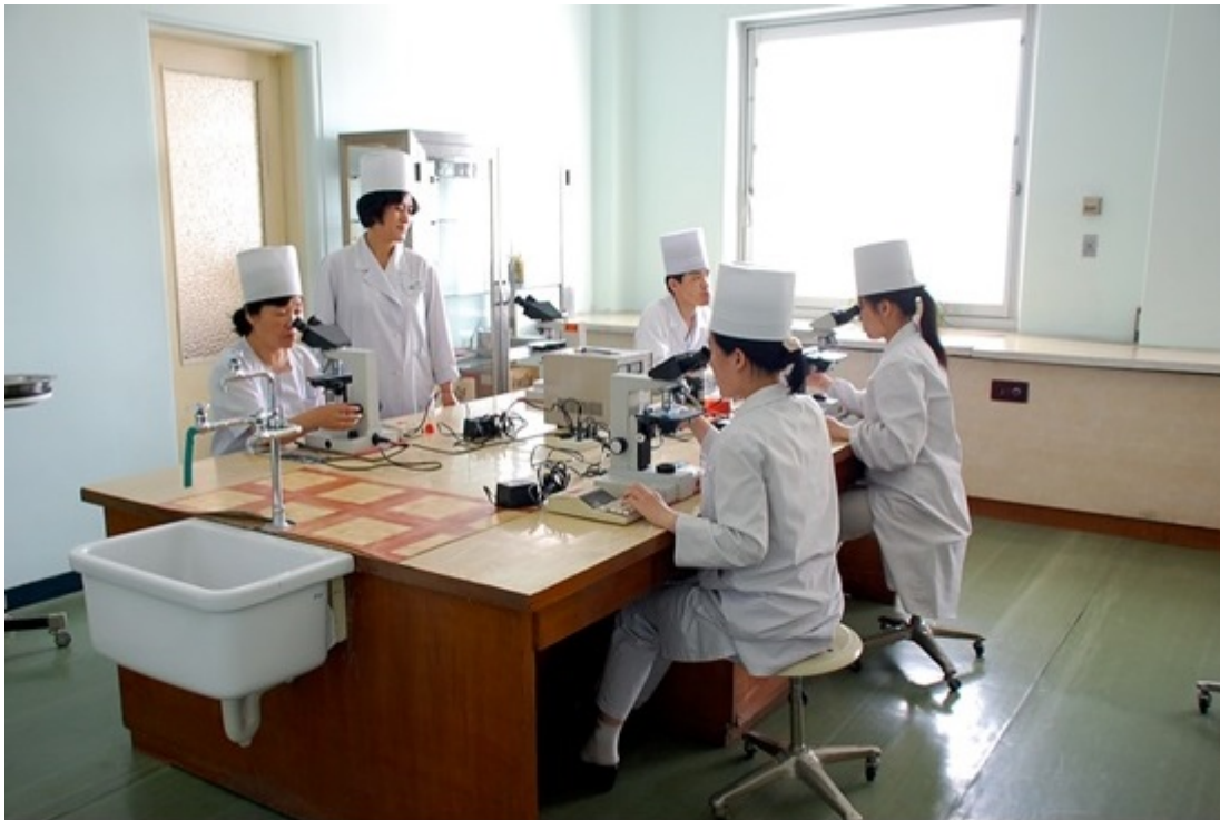
Photo 1: Pyongyang, North Korea – Lab at Maternity Hospital

for communicable disease relatively well, but quality care of non-communicable diseases cannot be optimized under the growing unofficial health market and increased disparity in healthcare access in the DPRK.