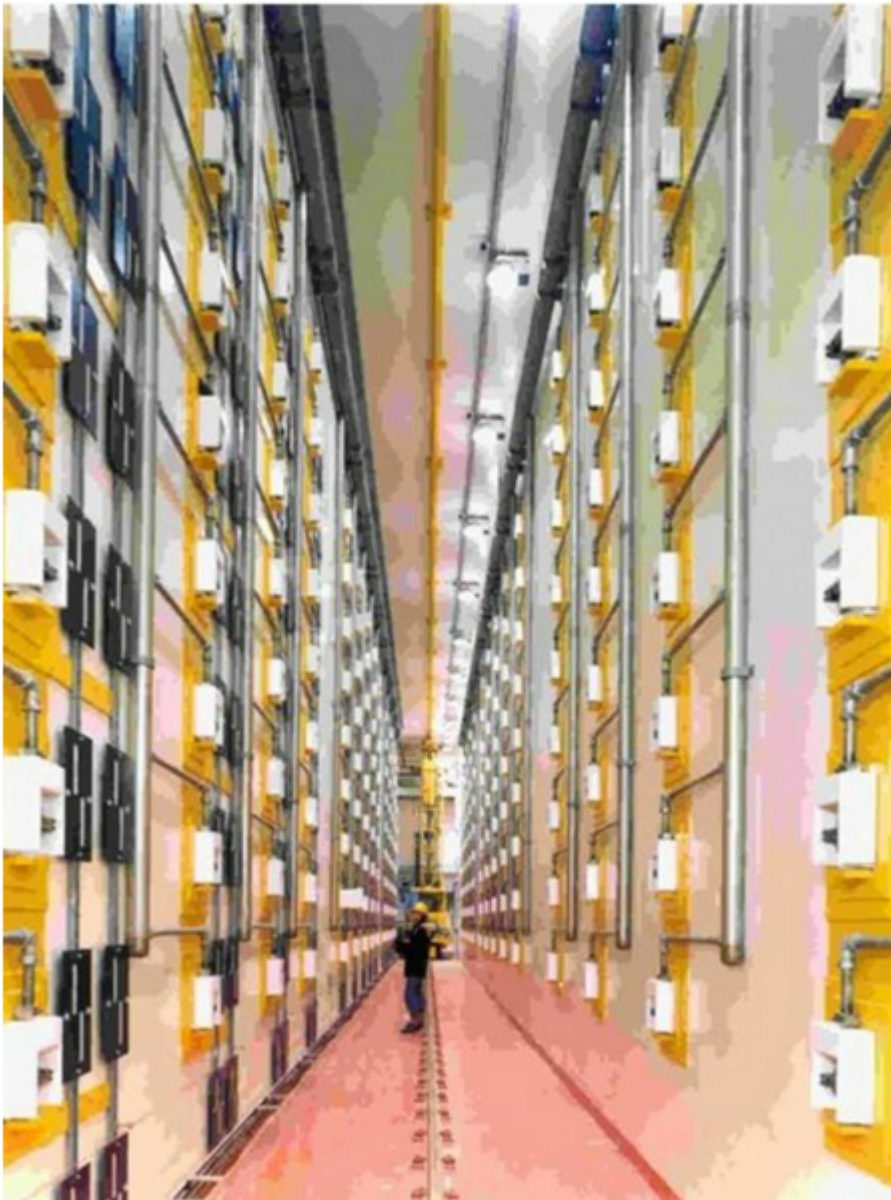
Plutonium storage area,

[caption id="attachment_24613" align="alignleft" width="450"]