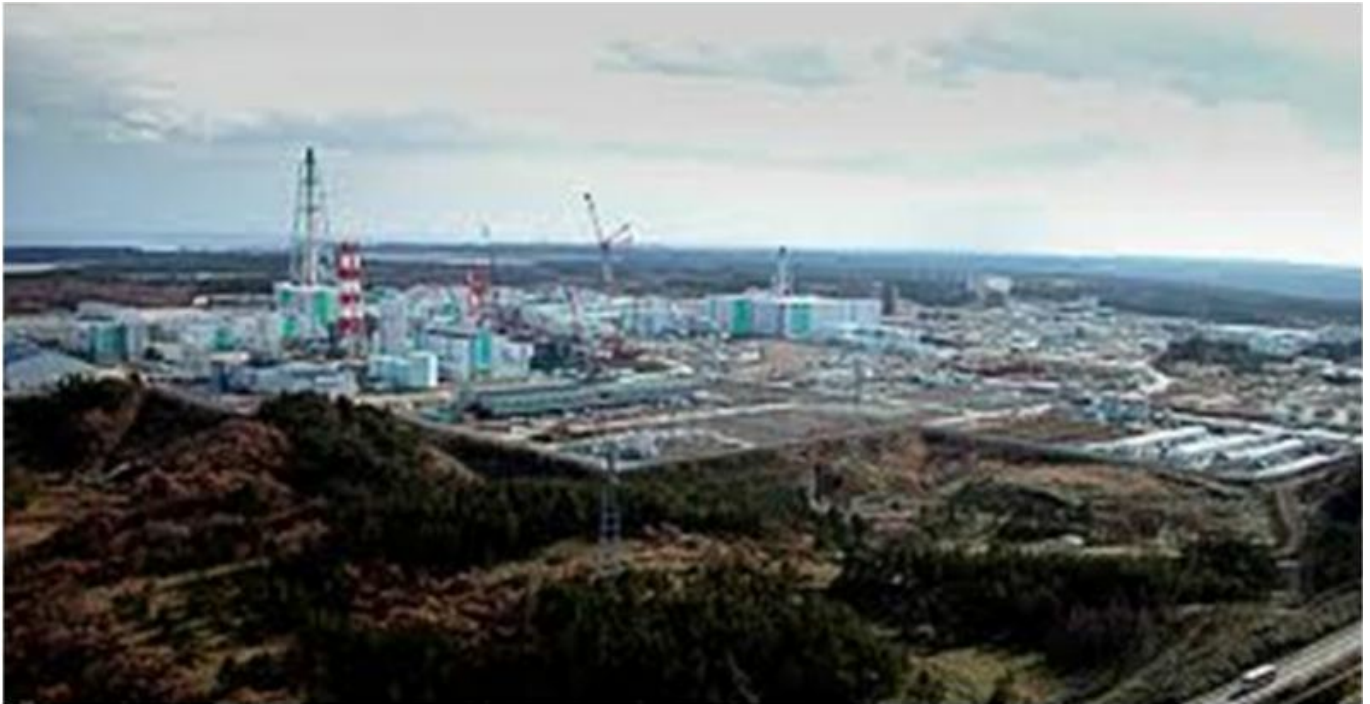
Aerial view of Rokkasho plant in Aomori[/caption]

Prof. von Hippel started his presentation by describing the IPFM [4] and its work. The IPFM was established in 2006 as an independent body dedicated to arms control and nonproliferation. It focuses on the management of nuclear materials. Two types of material pose a particular problem, plutonium and highly enriched uranium. There are 500,000 kilograms of plutonium in existence globally, which is enough for approximately 100,000 nuclear weapons. Half of this was produced during the Cold War in weapons programs, whereas the other half was produced for civilian use in reactors. Civilian-use plutonium was produced in the belief that uranium 235 was scarce and so there was a pressing need to build new reactors that would use uranium more efficiently. These new reactors were the plutonium breeder reactors. About 1% of the waste produced by normal reactors is plutonium.