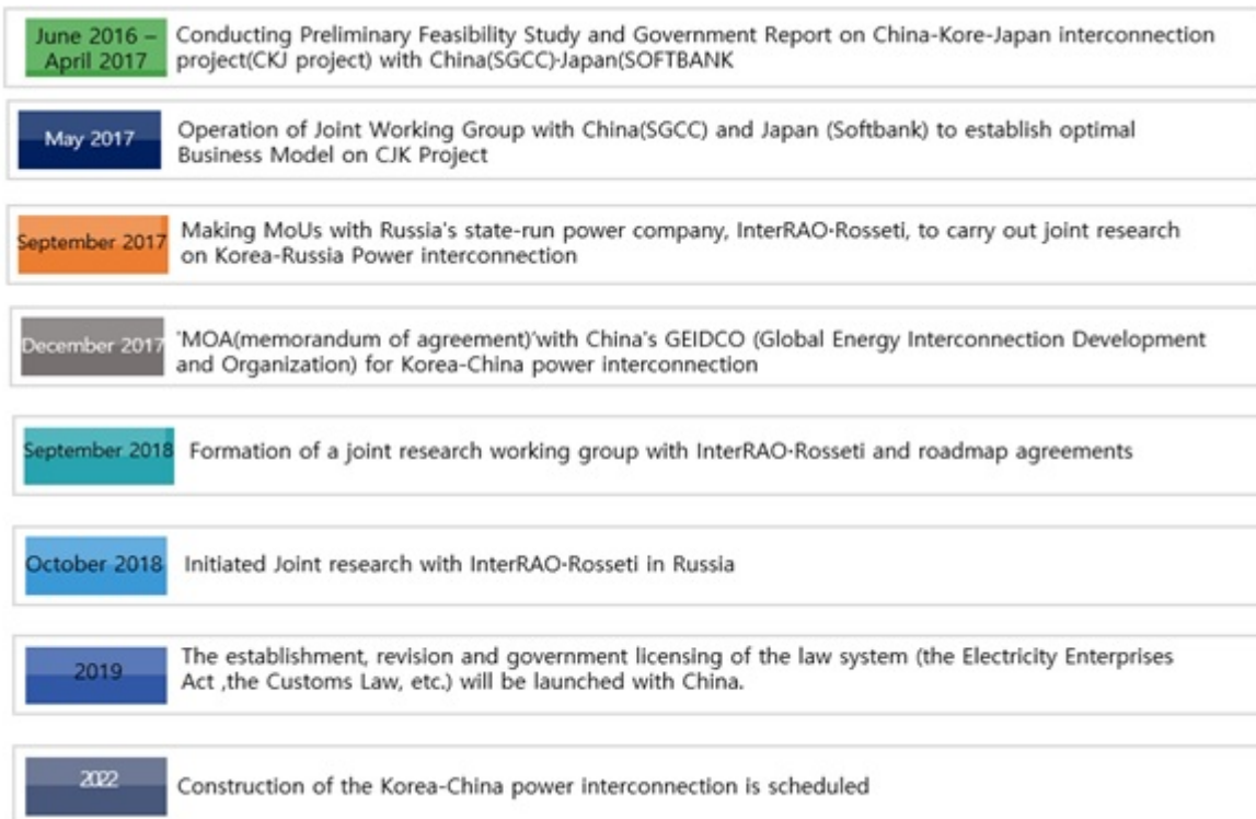
Figure 2: The Role of KEPCO in a Recent Power Interconnection Project in Northeast Asia