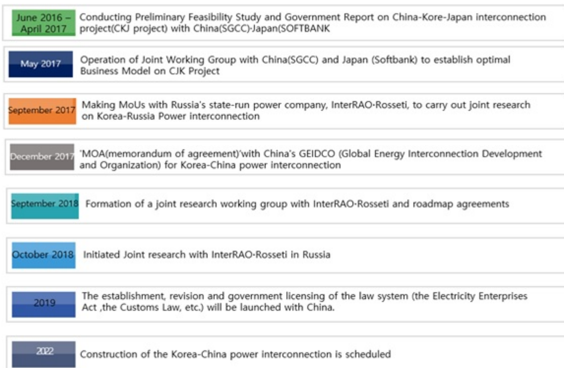
Figure 2: The Role of KEPCO in a Recent Power Interconnection Project in Northeast Asia

Source: Hankyung Magazine published on Jan-03- 2019