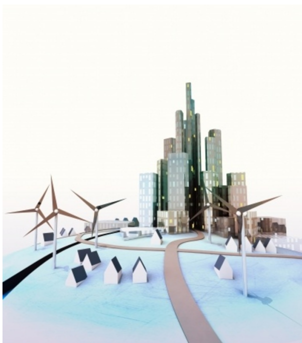
Toshiba Smart Community

The intellectual leadership as well as institutionalization of stadtwerk-centred smart communities opens the potential for a profound shift in the R&D investment priorities with Hitachi, Toshiba and Mitsubishi's power-unit operations. The makers are clearly aware of the business opportunity. Toshiba, for example, detailed its smart community growth strategy on December 16 2011, declaring that the smart community market was to expand to YEN 163 trillion by 2015 and that they were aiming at YEN trillion, or 8% of this total. 22 The big three's operations are at present clearly divided among those who want to stick with nuclear (as well as invest in next-generation technologies championed by Tanaka Nobuo and others), those who want to emphasize Carbon Capture and Storage (CCS)-equipped fossil fuel power units, and those who want to stress all of the technology involved in the smart community as a context for renewables. These latter systems include not just solar and wind, but also waste-heat recovery in sewerage systems as well as other advanced gear that is being deployed within Japan and in a host of other countries, including Denmark, Canada, and other aggressive smart city competitors.