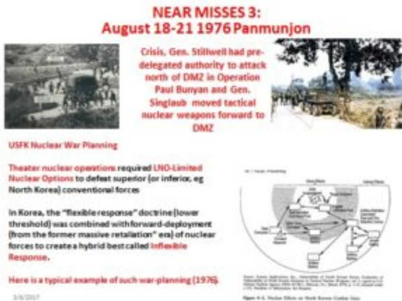
Figure 2: August 1976 Crisis