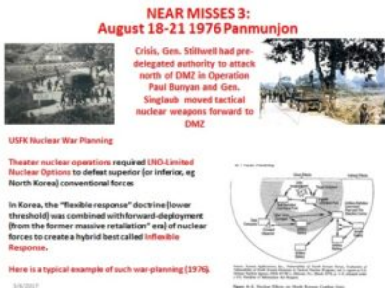
Figure 2: August 1976 Crisis