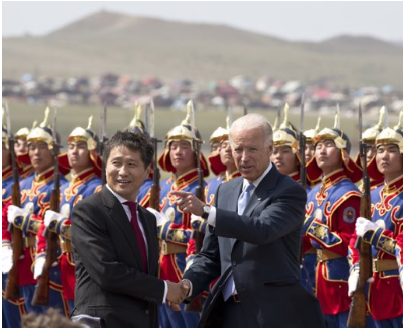
U.S. Vice President Joe Biden chats with Mongolian Prime Minister Batbold Sukhbaatar - August 22, 2011.