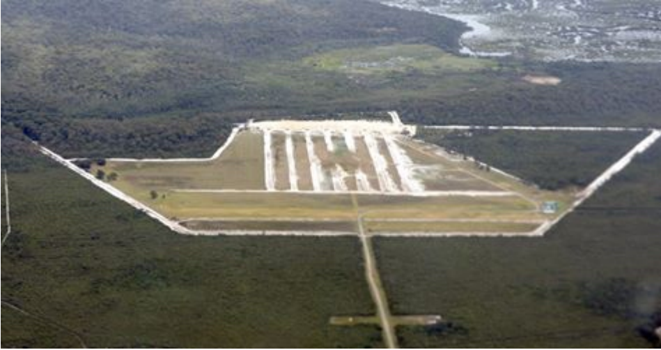
Salt Ash Air Weapons Range 2015 Australian Noise Exposure Forecast map (2011)