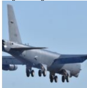
Andy-87 (C), '61-0040 - DSC_7249.JPG', (image supplied), photo date 13 February 2024 (time: 16:37:27)[/caption]

[caption id="attachment_99794" align="alignnone" width="150"]