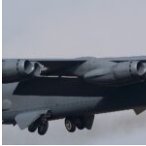
Michiel Van Herten, '60-0025', image supplied, photo date 28 March 2019[/caption]

[caption id="attachment_99790" align="aligncenter" width="150"]