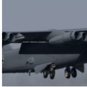
Michiel Van Herten, '60-0058', image supplied, photo date 28 March 2019, [/caption]

[caption id="attachment_99787" align="aligncenter" width="150"]