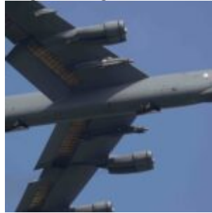
Michiel Van Herten, '61-0015', image supplied, photo date 28 March 2019[/caption]

[caption id="attachment_99789" align="aligncenter" width="150"]