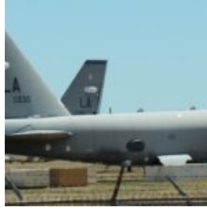
N94504, '60-0030', image supplied, photo date 24 March 2016. The aircraft is in storage at Davis-Monthan AFB.[/caption]

[caption id="attachment_99800" align="alignnone" width="150"]