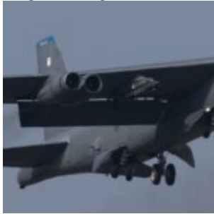
Michiel Van Herten, '61-0013', image supplied, photo date 28 March 2019[/caption]

[caption id="attachment_99788" align="aligncenter" width="150"]