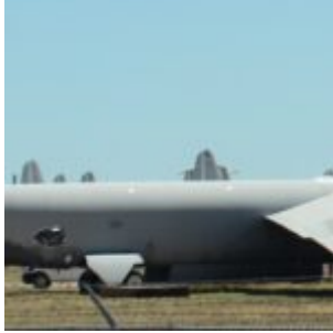
N94504, '60-0010', image supplied, photo date 24 March 2016[/caption]

[caption id="attachment_99801" align="alignnone" width="150"]