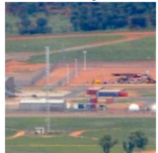
Relay Ground Station from north, 23 January 2016[/caption]

[caption id="attachment_47068" align="aligncenter" width="150"]