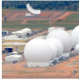
Main compound, Operations Buildings, and Torus multibeam antenna, [/caption]