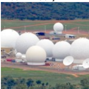
Principal SIGINT and OPIR antennas from northeast, [/caption]