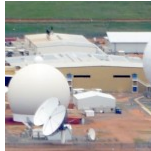
Main compound from north, Felicity Ruby, 23 January 2016[/caption]