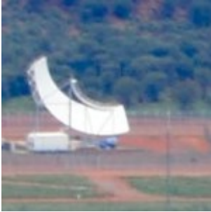
Antenna 08-A Torus multibeam antenna, Felicity Ruby, 23 January 2016[/caption]

[caption id="attachment_47062" align="aligncenter" width="150"]