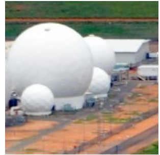
SIGINT compound, west side, and south-west end of Operations Buildings area, [/caption]