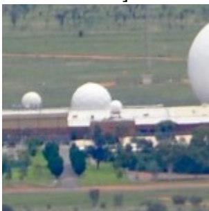
Operations buildings from east, Felicity Ruby, 23 January 2016[/caption]