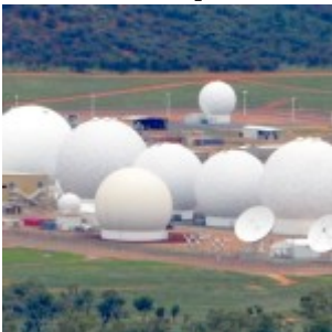
Principal SIGINT and OPIR antennas from northeast, 23 January 2016[/caption]