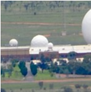
Operations buildings from east, Felicity Ruby, 23 January 2016[/caption]