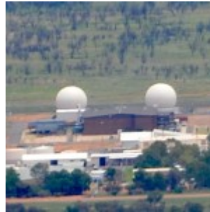
Relay Ground Station from east