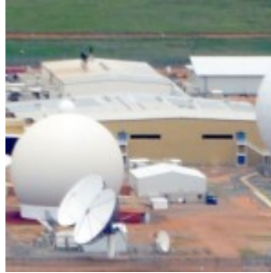
Main compound from north, Felicity Ruby, 23 January 2016[/caption]

[caption id="attachment_47064" align="aligncenter" width="150"]