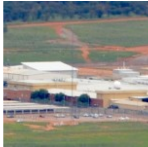
Operations Buildings area from northeast, [/caption]