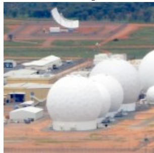
Main compound, Operations Buildings, and Torus multibeam antenna, 23 January 2016[/caption]