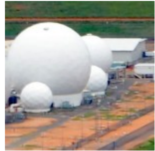
SIGINT compound, west side, and south-west end of Operations Buildings area, 23 January 2016[/caption]