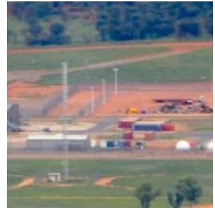
Relay Ground Station from north, Felicity Ruby, 23 January 2016[/caption]