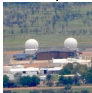
Relay Ground Station from east, Felicity Ruby, 23 January 2016[/caption]