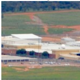
Operations Buildings area from northeast, 23 January 2016[/caption]

[caption id="attachment_47065" align="aligncenter" width="150"]