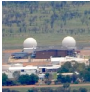
Relay Ground Station from east, 23 January 2016[/caption]

[caption id="attachment_47067" align="aligncenter" width="150"]