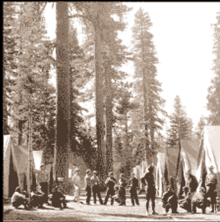
CCC Tent Camp

The CCC planted between 3 and 5 billion trees