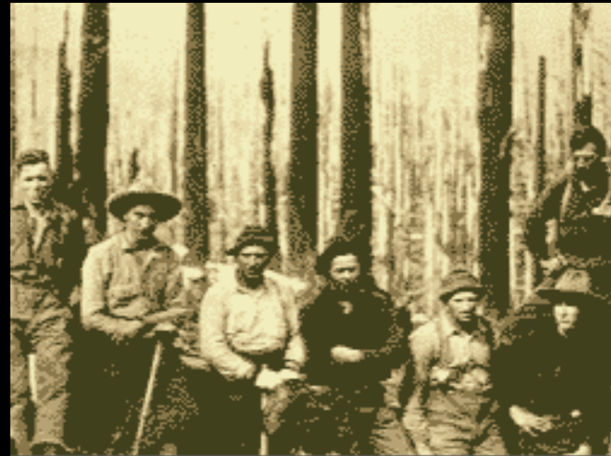
Civilian Conservation Corps workers