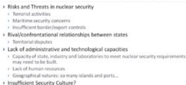
Figure 3: Uncertainty in international security and political climate and environment

Undoubtedly the risks and threats that constitute nuclear insecurity are real. These include terrorist activities; maritime security concerns; and insufficient border and export controls. Relatedly, confrontational and competitive relationships between states, including territorial disputes, combine with lack of administrative and technological capacities to establish conditions that undermine nuclear security. The latter include deficits in the capacity of state, industry and laboratories to meet requisite nuclear security requirements, lack of human resources, the sheer number of islands and ports that facilitate nuclear smuggling and non-state actor mobility (see Figure 3).