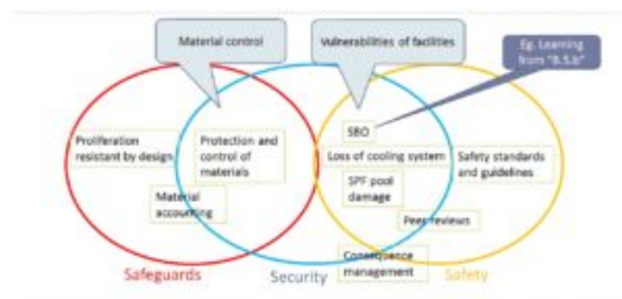
Figure 1: Interface among '3S' Learnt from Fukushima

In this essay, the key lessons learned after the 311 Fukushima Nuclear Accident are outlined. These lessons pertained to safeguards, security, and safety, and revealed the critical inter-dependency and overlap between these elements, as well as the necessity to attend to each as a disparate imperative in nuclear spent fuel management (see Figure 1).